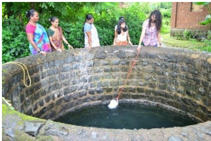
The village well as main water source for community