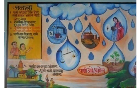
Classroom Wall painted with environmental water conservation chart