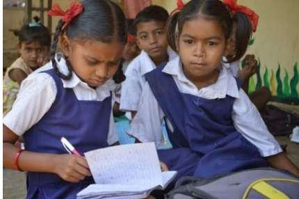
Village Primary Public school students

Here are some pictures of the beautiful nature surrounding and the local community, much of LSF's mission to transform lives of children, youth and women of the native community.