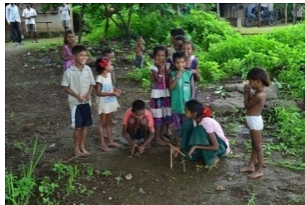
The native childrenen enjoying a monsoon evening