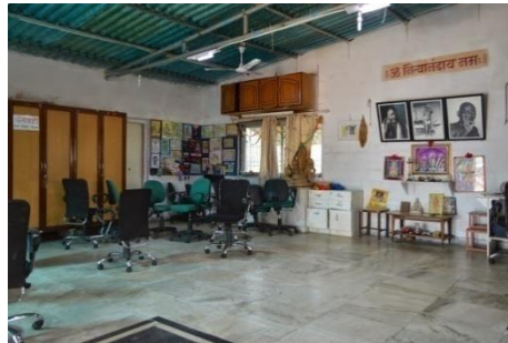
Learning Space Hall