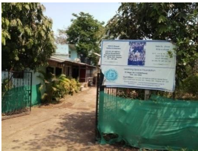
Learning Space Center at Village Kelthan