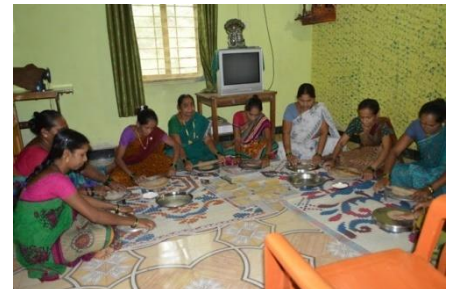
A local women's self-help group conducting session on making home food products