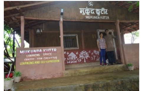
The indigenous block for learning creative art and expression at LSF center