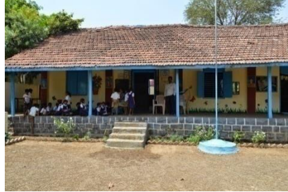
Village Primary and Middle Level school near LSF center